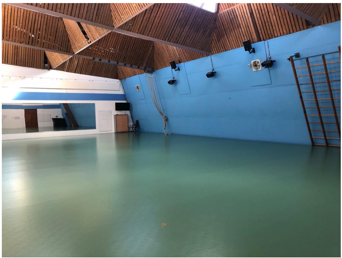
Sports Hall 2