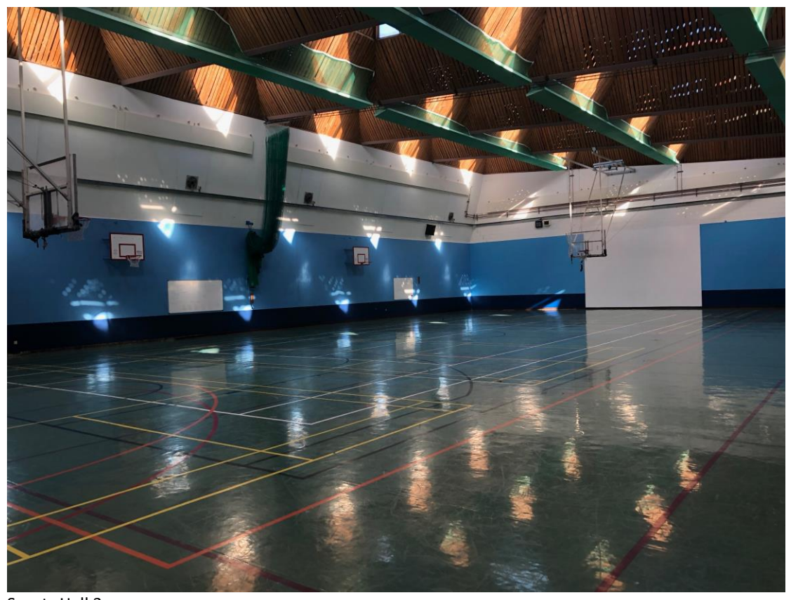
Sports Hall 3