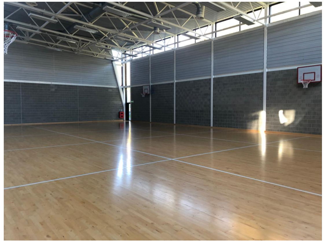
Sports Hall 1

University of Limerick, Physical Education & Sport Science (PESS) Building, Castletroy, Limerick, Ireland. For this conference we will use the 3 large Sports halls, lecture theatres and classrooms all located within the same building.