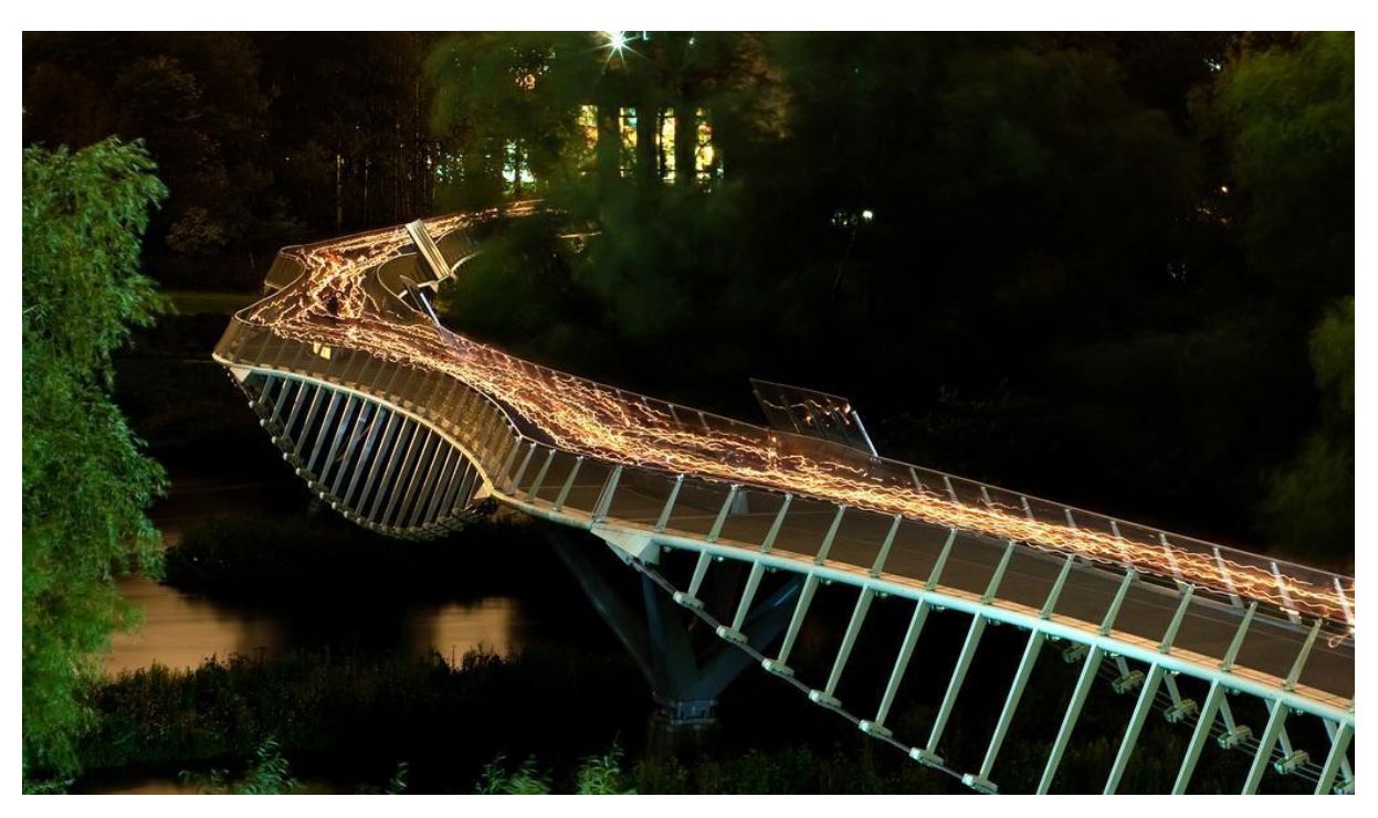
The living bridge